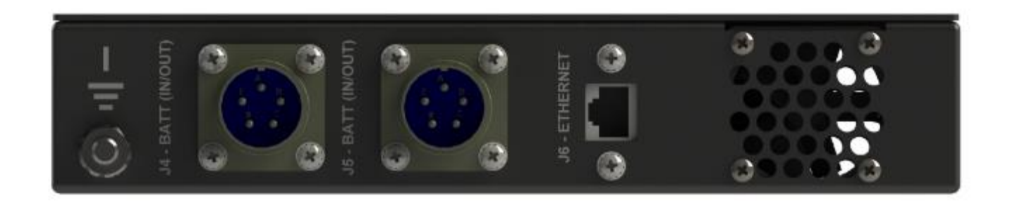
PG400UPS-AC-DC-BATT-28 Rear View